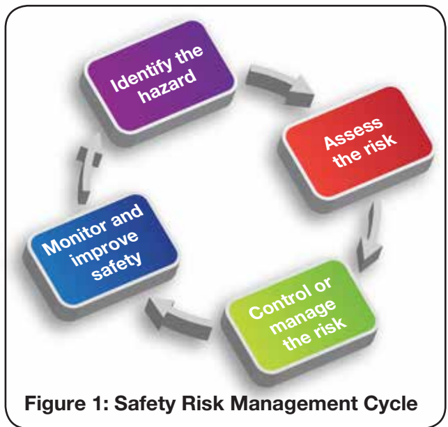
Figure 1: Safety Risk Management Cycle

This is a continuous improvement cycle and your policies and procedures should detail the practices that you adopt to control or manage risks in your workplace.